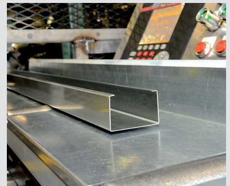
Zero waste from sections produced to length in factory