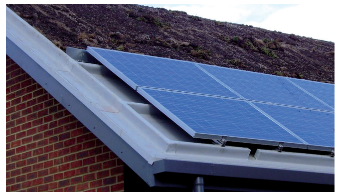
Figure 3 Integration of PV panels and green roof in modular construction (Image courtesy of Fusion Building Systems)

An A+ rating gains two additional points under the materials ratings in the Code for Sustainable Homes.