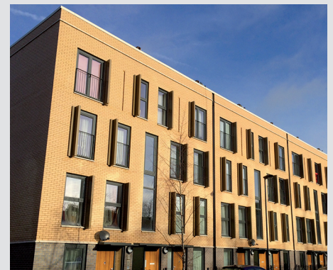
Houses development in London